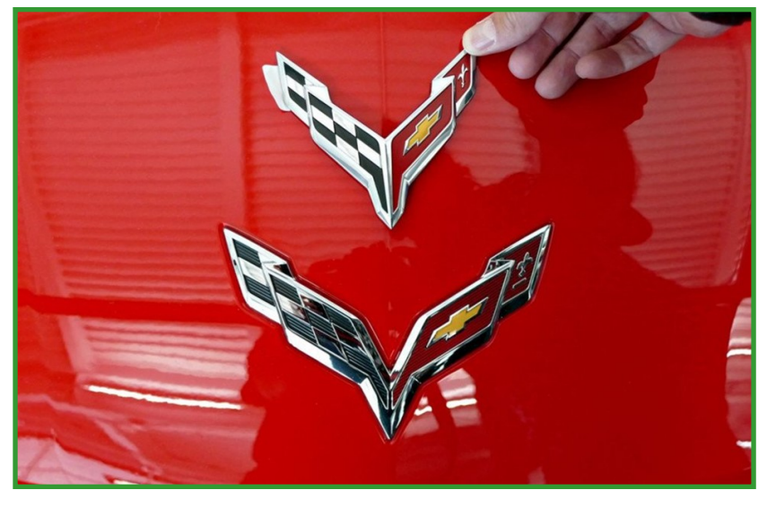
A comparison of the C7 and C8 logo.

Chevrolet seems to be going full-steam in promoting the next Corvette and Tadge even mentioned that it was a nice change from trying to hide the worst-kept secret in plain sight. With the recent frequency that tidbits have been forthcoming, we feel that there's likely more juicy fruit waiting to fall from the tree before the big reveal on July 18, 2019.